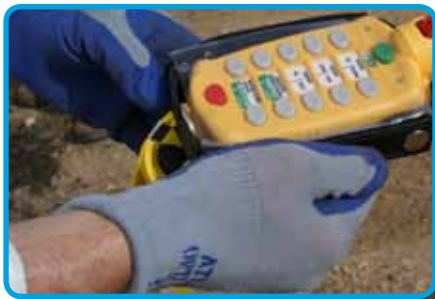
The operator can control the boom up/down, in/out and left/right with the wireless controls.

A user-friendly, ergonomically designed control box is located curbside for easy access and efficient operation. Enclosed in an aluminum box, it is protected from environmental elements. Controls include a tachometer and hour meter for both chassis and blower, temperature indicators for various systems, water system on/off with multi-flow, complete boom and body dump functions, E-Stop and more. A wireless remote is standard, putting all of the controls in the operator's hands directly at the worksite.